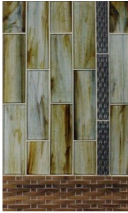
#194 Tozen 2x6 in Copper Natural, Pewter SPA80 1x6 and Mu Basketweave in Amberwood