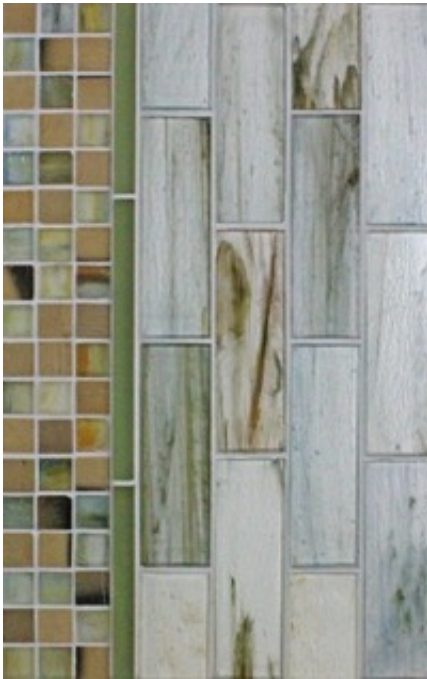
#193 Tozen 2x6 in Strontium Natural, Flat Bar in Sage Silk and Momen 1x1 Glass Blend in Camel and Xenon Silk