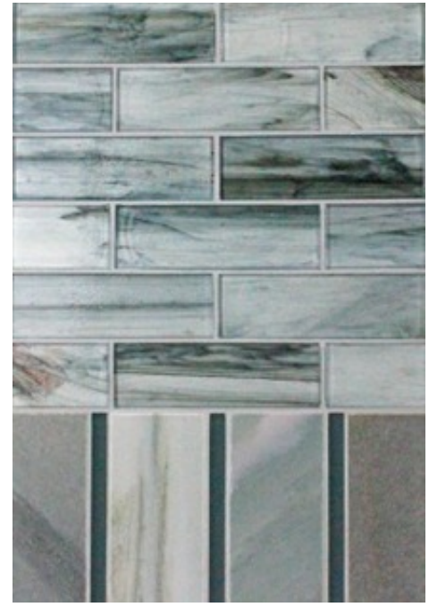
#195 Tozen 2x6 in Oxygen Natural, 3x6 Honed Slate in Moss Green and Tomei Bar in Woodland Green Silk