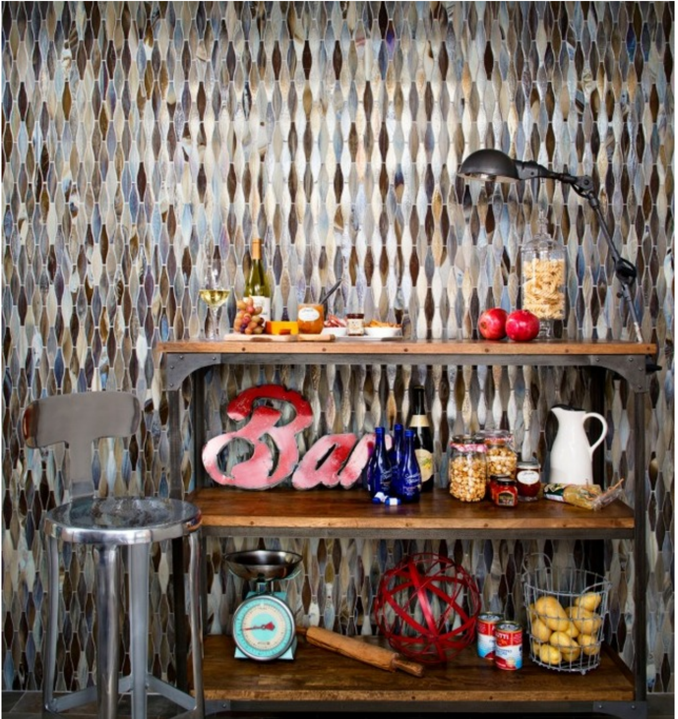
Fascinating Rhythm: Agate in Taiko