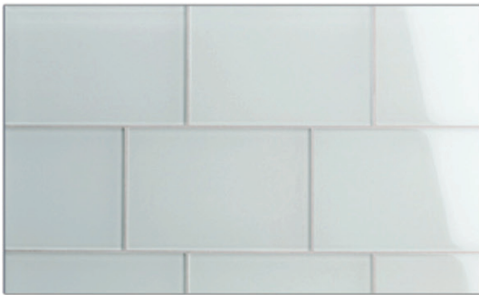
6 \times 9