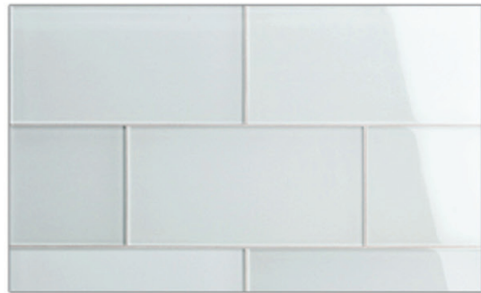
6 \times 12