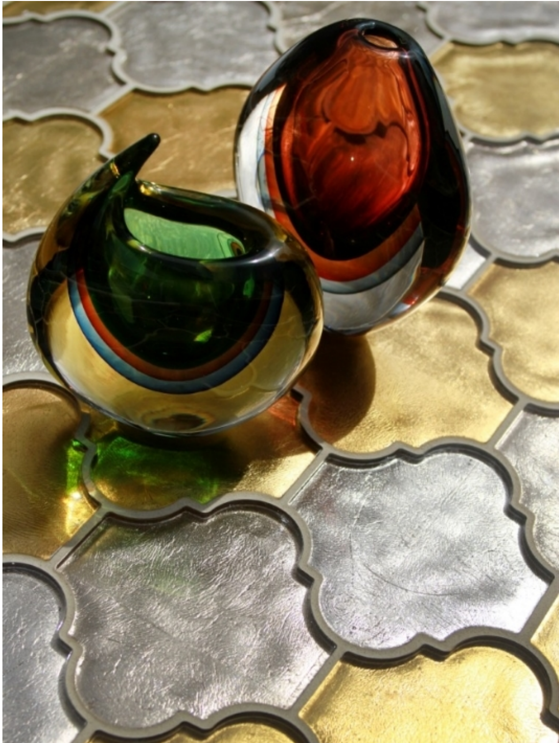
Old Fashioned Glow in Arabesque