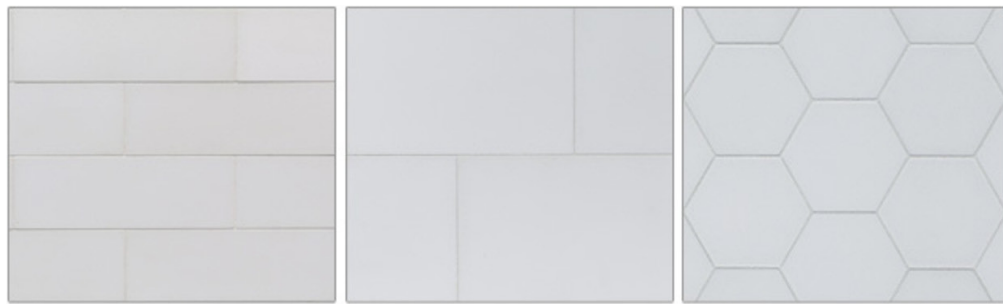
3 x 9