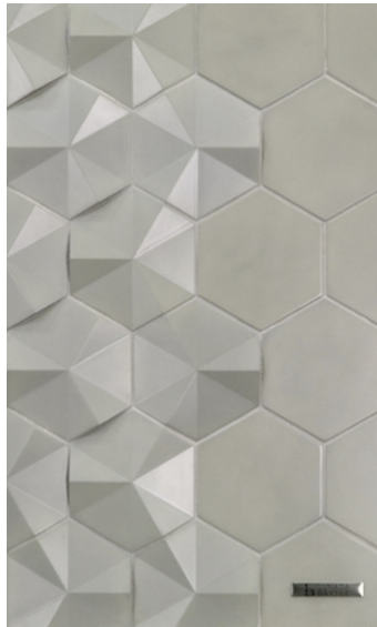
#240 Contourz Fanfare Hex and 4-inch Hex Stoneware

Our 12 x 19 Concept Board showcases Contourz installation possibilities.