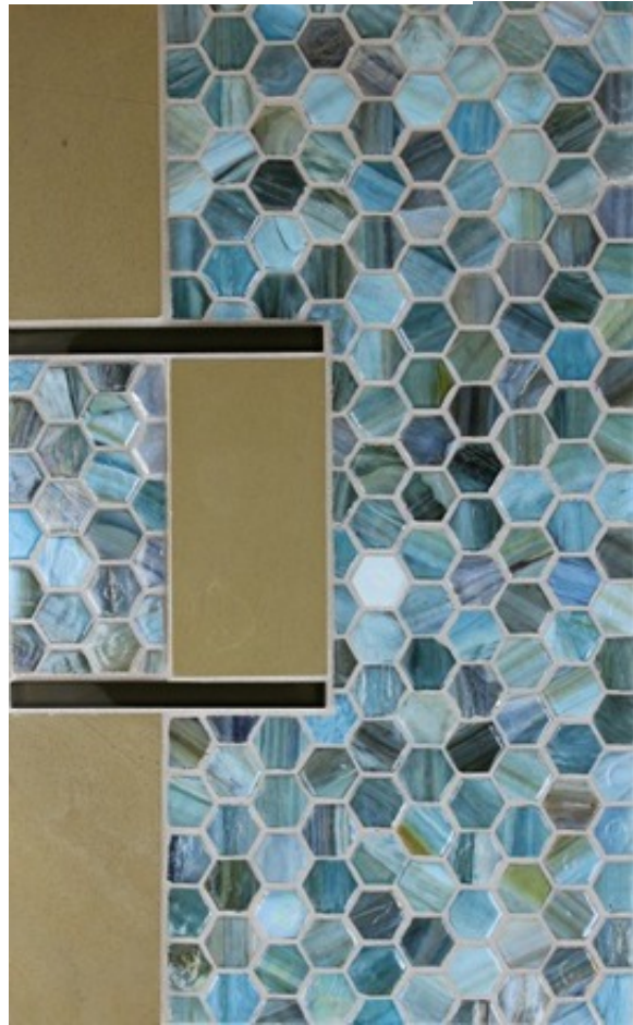
#197 Agate Hexagon in Rimini Pearl with 3x6 Barley Honed Slate and Tomei Flat Bars in Cocoa Natural.