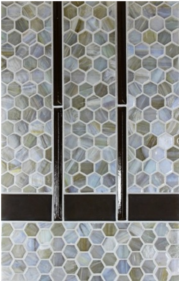
#196 Agate Hexagon in Cortona Pearl with Banacha Woodhouse Bars in Natural Finish and Old Fashioned 2x4 in Banacha Silk.