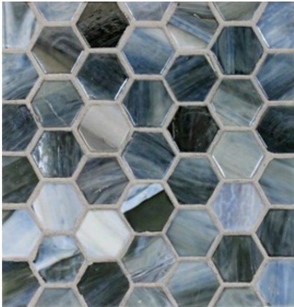
Agate Hex in Pisa Pearl and Silk.