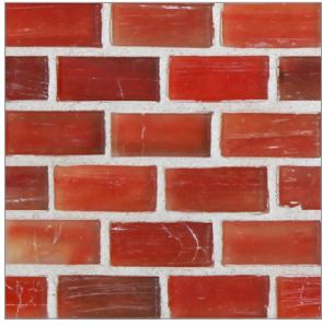
Marrakech Red Silk