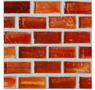
Marrakech Red Natural