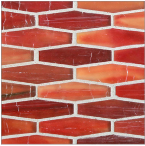
Marrakech Red Silk