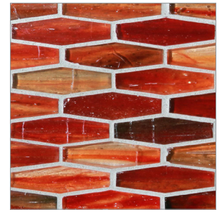
Marrakech Red Natural