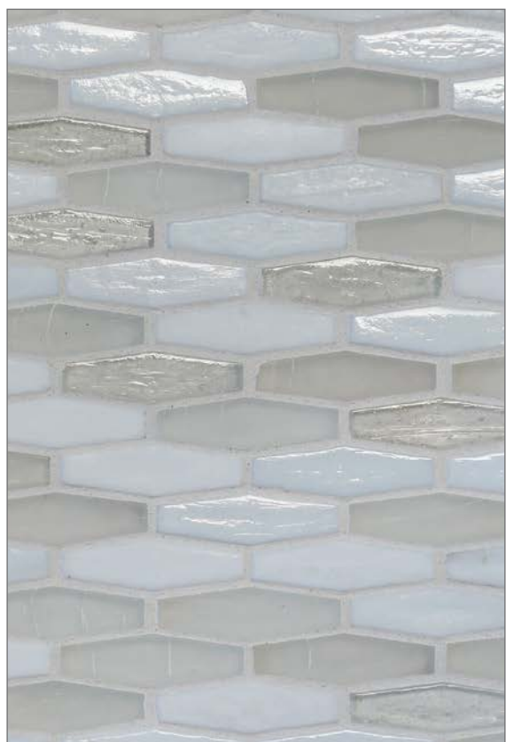
Half & Half