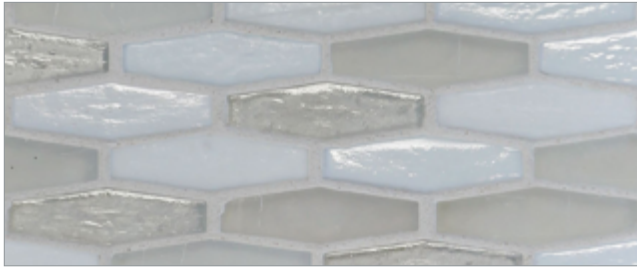
Half & Half