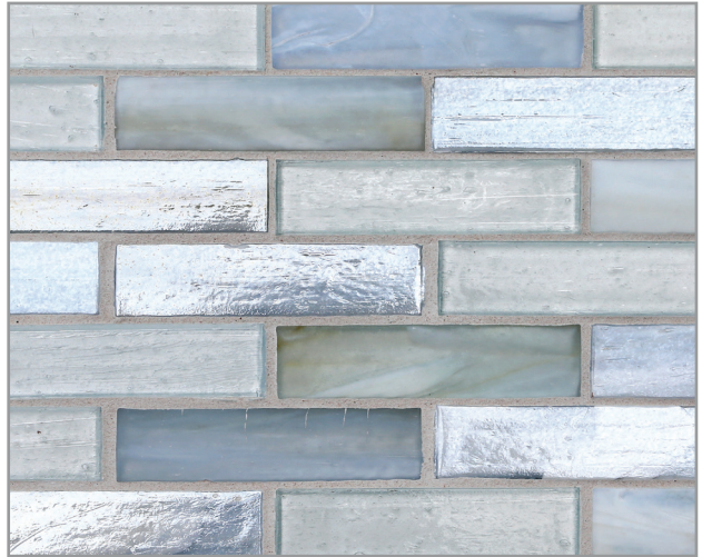
1 x 4 Brick (25 mm x 100 mm)