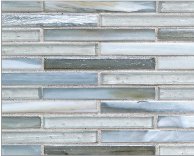
1/2 x 4 Brick (11.5 mm x 100 mm)