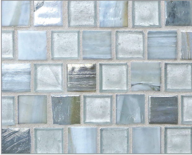
1 x 1 Offset (25 mm x 25 mm)