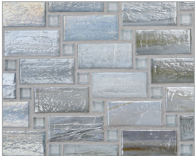
Vineyard (1/2 x 1/2, 1 x 2) (11.5 mm x 11.5 mm, 25 mm x 50 mm)