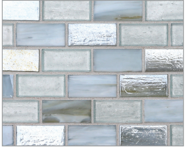
1 x 2 Brick (25 mm x 50 mm)