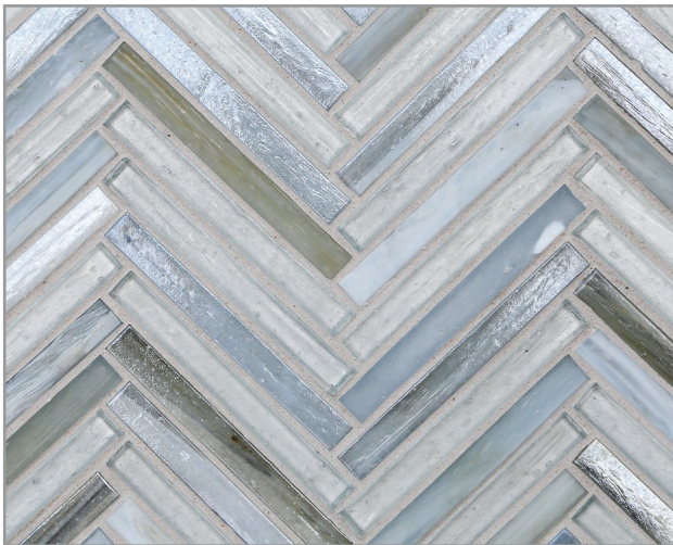
Zig & Zag (1/2 x 4) (11.5 mm x 100 mm)