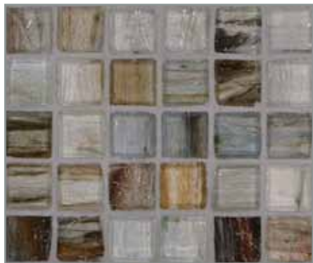
1 x 1 Mosaic (25mm x 25mm)