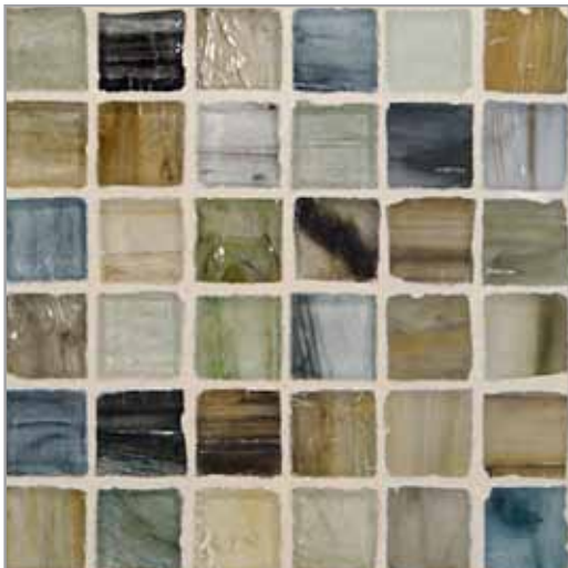
Natural | Silk Kukai