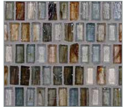
1/2 x 1 Stacked (11.5mm x 25mm)