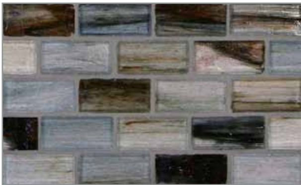
1 x 2 Brick (25mm x 50mm)