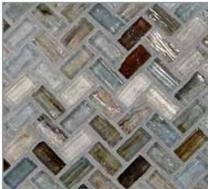
Herringbone (1/2 x 1) (11.5mm x 25mm)