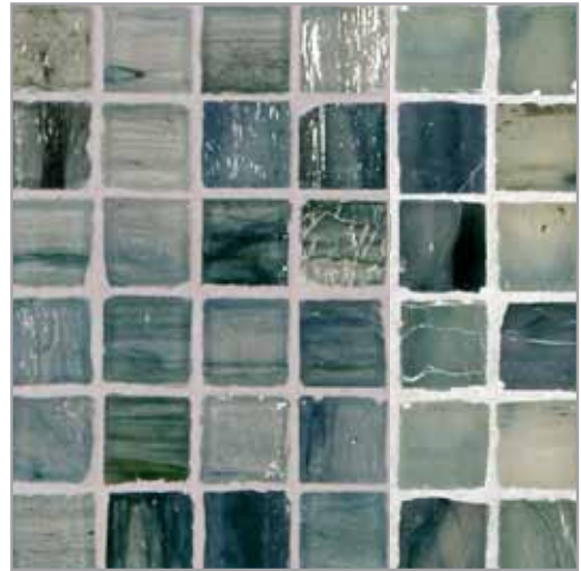
Natural | Silk Hokkaido