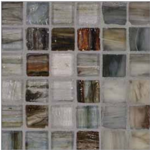
Natural | Silk Zushi