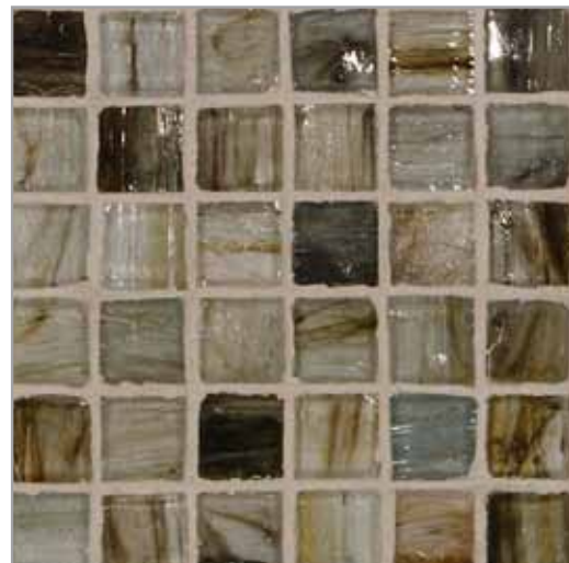
Natural | Silk Hida