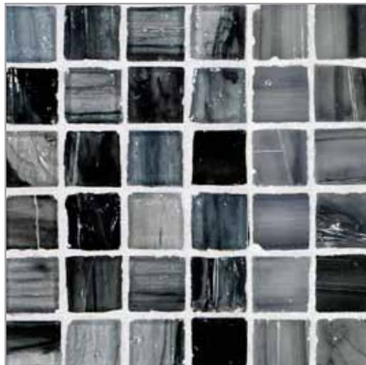
Natural | Silk Sado