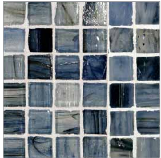
Natural | Silk Kyoto