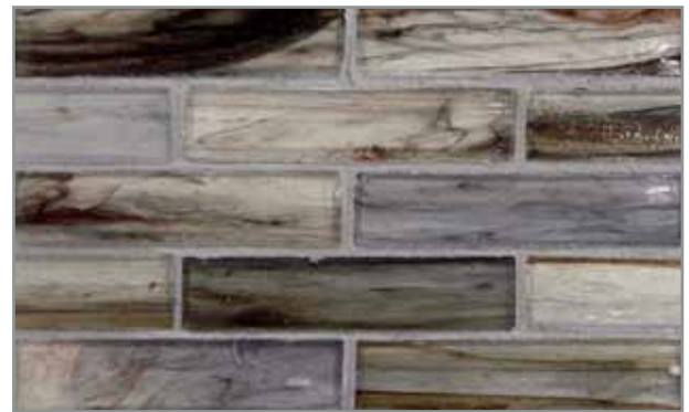
1 x 4 Brick (25mm x 100mm)