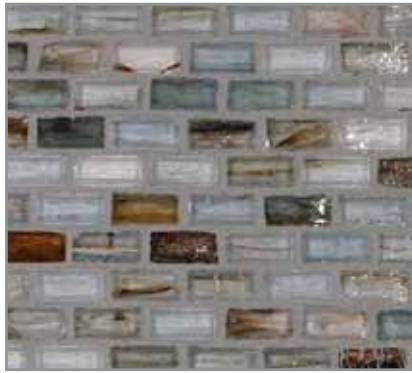
1/2 x 1 Mini Brick (11.5mm x 25mm)