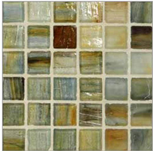
Natural | Silk Tajimi