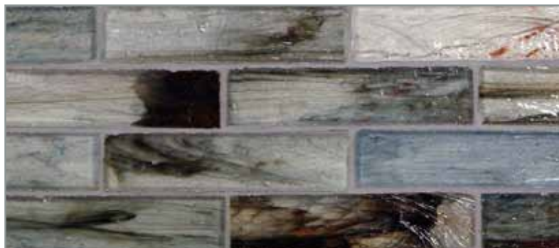
1-3/8 x 6 Brick (35mm x 146mm)