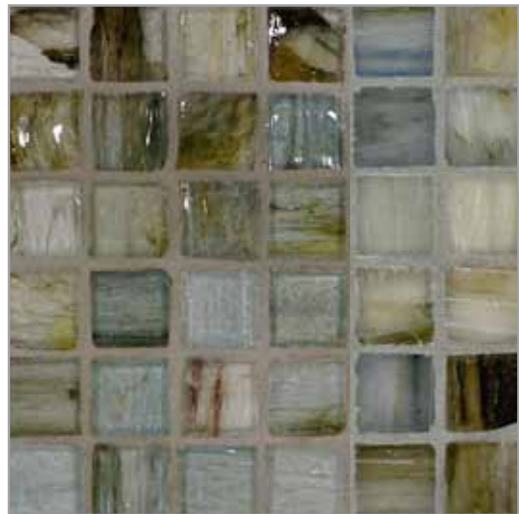
Natural | Silk Sendai