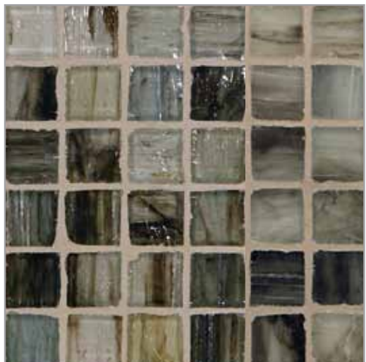
Natural | Silk Ohara