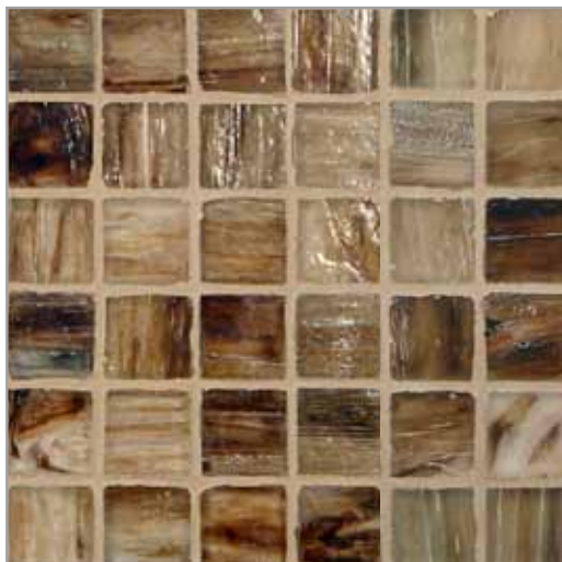
Natural | Silk Hagi