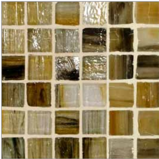
Natural | Silk Morioka