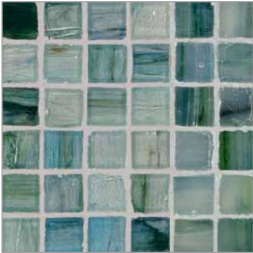
Natural | Silk Izu