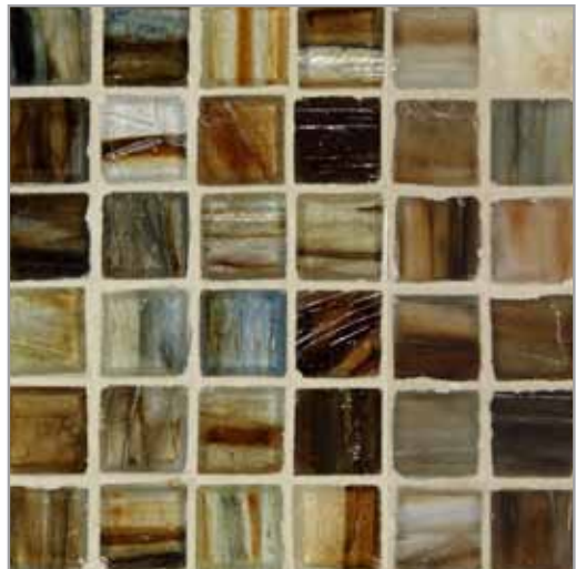
Natural | Silk Karatsu