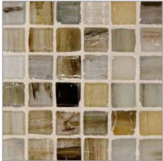
Natural | Silk Sesshu