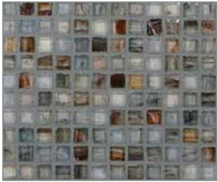
1/2 x 1/2 Mini Mosaic (11.5mm x 11.5mm)