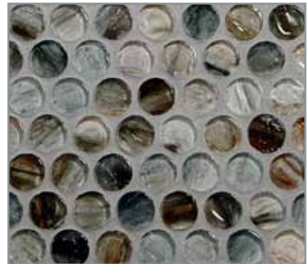
Penny Round (3/4) (19mm)