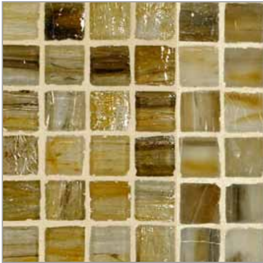
Natural | Silk Chuzenji