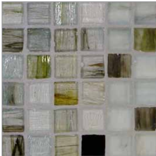
Natural | Silk Ogari