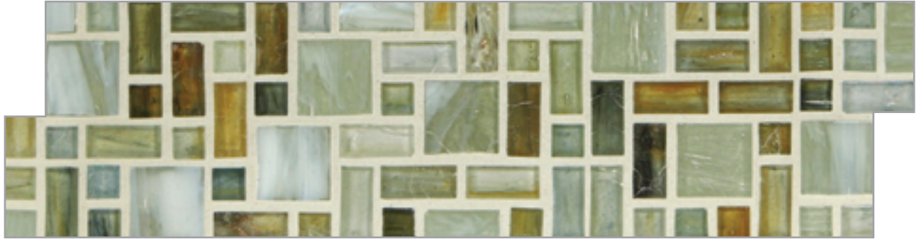
3 x 12 Border