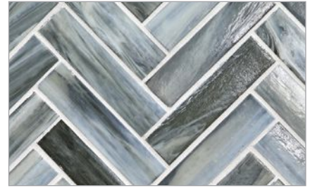
1 x 4 Herringbone (25 mm x 100 mm)