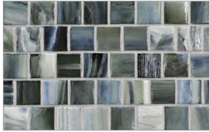
1 x 1 Offset (25 mm x 25 mm)