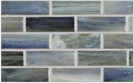
1 x 3 Brick (25 mm x 78 mm)