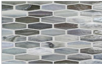
Martini ( \frac{5}{8} x 2) (15 mm x 50 mm)