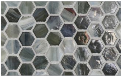
1" Hexagon (25 mm x 25 mm)