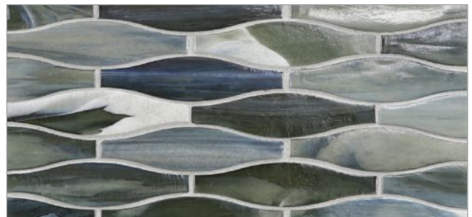
Taiko (1 \frac{1}{4} x 5) (31 mm x 124 mm)

More patterns available at LunadaBayTile.com