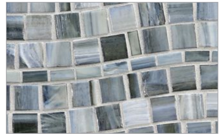
Rio ( \frac{1}{2} x 1 & 1 x 1) (Pearl and Silk) (12 mm x 25 mm, 25 mm x 25 mm)