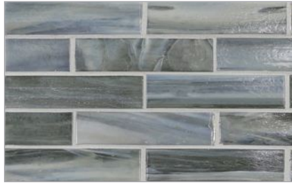
1 x 4 Brick (25 mm x 100 mm)