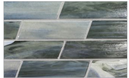
Dash (1 \frac{1}{4} x 5) (34 mm x 124 mm)