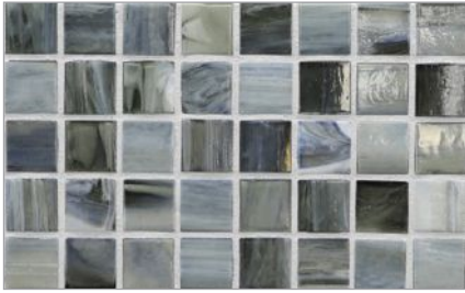
1 x 1 Mosaic (25 mm x 25 mm)