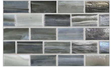
1 x 2 Brick (25 mm x 52 mm)