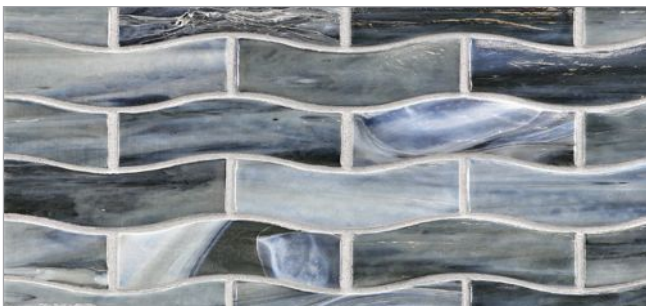
Zing 1 x 4 (25 mm x 100 mm)