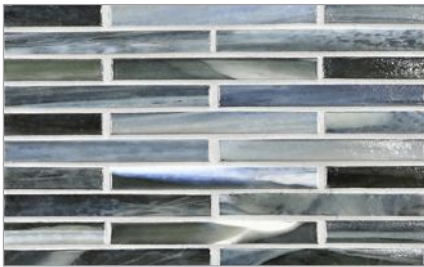
\frac{1}{2} x 4 Brick (12 mm x 100 mm)