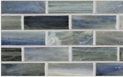
1 x 3 Brick (25 mm x 78 mm)