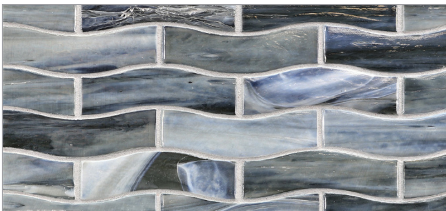
Zing 1 x 4 (25 mm x 100 mm)