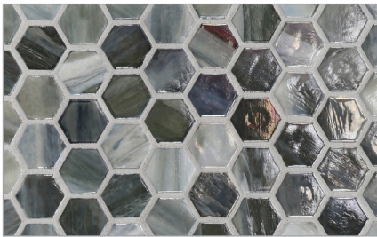
1" Hexagon (25 mm x 25 mm)