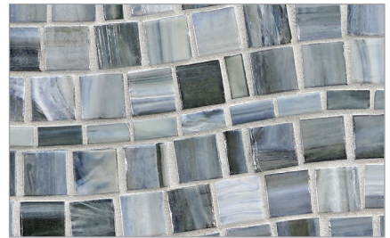
Rio ( \frac{1}{2} x 1 & 1 x 1) (Pearl and Silk) (12 mm x 25 mm, 25 mm x 25 mm)