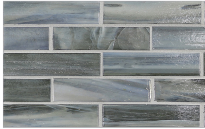
1 x 4 Brick (25 mm x 100 mm)