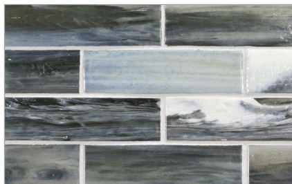
1\frac{1}{4} x 5 Brick (34 mm x 124 mm)