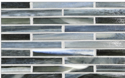
\frac{1}{2} x 4 Brick (12 mm x 100 mm)