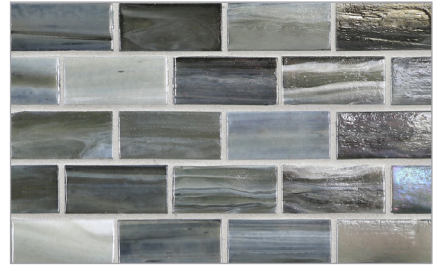
1 x 2 Brick (25 mm x 52 mm)