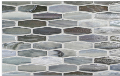
Martini ( \frac{5}{8} x 2) (15 mm x 50 mm)