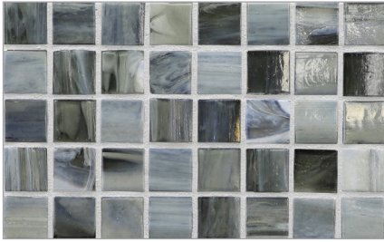
1 x 1 Mosaic (25 mm x 25 mm)