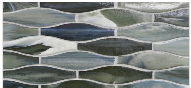
Taiko ( 1\frac{1}{4} x 5) (31 mm x 124 mm)

More patterns available at LunadaBayTile.com