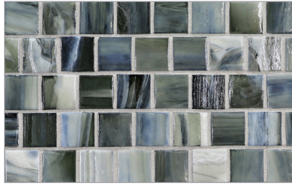
1 x 1 Offset (25 mm x 25 mm)