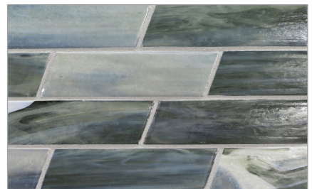
Dash ( 1\frac{1}{4} x 5) (34 mm x 124 mm)