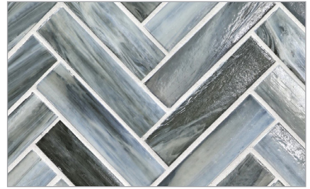
1 x 4 Herringbone (25 mm x 100 mm)